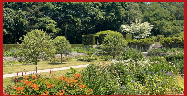
Castle Drogo – National Trust

“We have been involved with the Carer Friendly Devon scheme since Devon Carers first started it. We understand the pressures of caring and recognised that we could make the lives of unpaid carers a little easier by offering them free access to our estate and grounds with their carers ID card. We also provide our staff with carer awareness training to enable them to support carers and make their visit as enjoyable as possible.”